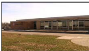
NEW WAVERLY VILLAGE HALL BARTON DISTRICTS 1,2,3,8

BARTON voters in Districts 1,2,3,8 will be voting at the new Waverly Village Hall.