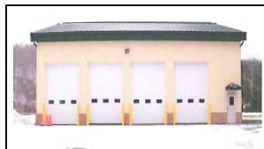
NEW WELTONVILLE FIRE STATION CANDOR 2

CANDOR voters in District 2 will be voting at the newly built Weltonville Fire Station.