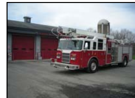
CANDOR FIRE STATION CANDOR DISTRICTS 1,3,4,5

CANDOR voters in Districts 1,3,4,5 will be voting at the Candor Fire Station.